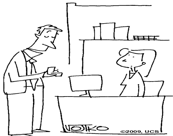
"Marry me, Miss Krauss, and I won't have to pay you overtime."

Some collective bargaining agreements provide for flexible scheduling or compensatory time in lieu of overtime, so please be sure that you review your contract before claiming overtime. Also, many contracts will require that an employee get approval for any overtime worked before an employee may be allowed to claim overtime, so check your contract for language that requires approval for overtime. However, if you do not get approval to work overtime, stick to your schedule and don't work when you aren't going to get paid because you cheat yourself out of pay that you have rightly earned when you work "off-the-clock."